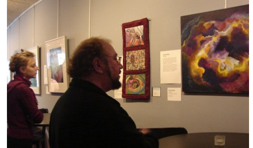
From left to right: Duluth Entertainment Convention Center, Duluth, MN; Sister Kenny Rehabilitation Institute, Minneapolis, MN; Rochester Civic Theater, Rochester, MN.