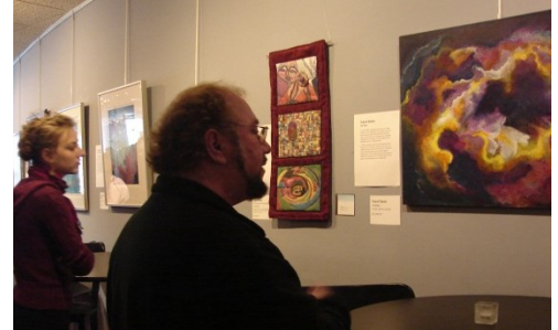
From left to right: Duluth Entertainment Convention Center, Duluth, MN; Sister Kenny Rehabilitation Institute, Minneapolis, MN; Rochester Civic Theater, Rochester, MN.